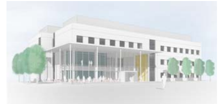
The BioEscalator, Churchill Hospital