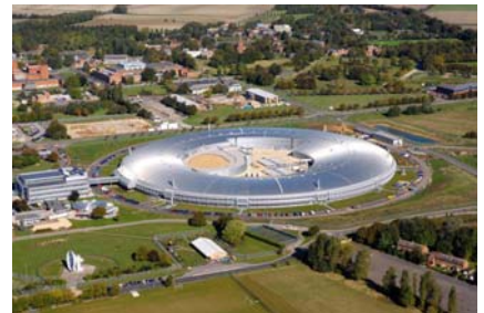
Diamond Synchrotron, Harwell