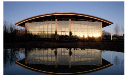
Sadler Building, Oxford Science Park