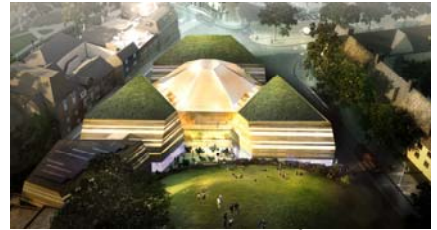
The Magnet Incubator, Oxford